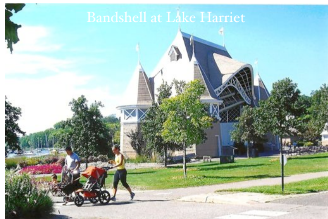
Bandshell at Lake Harriet

We walked across the bridges in downtown Minneapolis and enjoyed sitting by the beautiful Mississippi River in both Twin Cities where we saw a parade of over 35 Segways. Oh, and the walleye dinner was delicious at The Tavern on Grand.