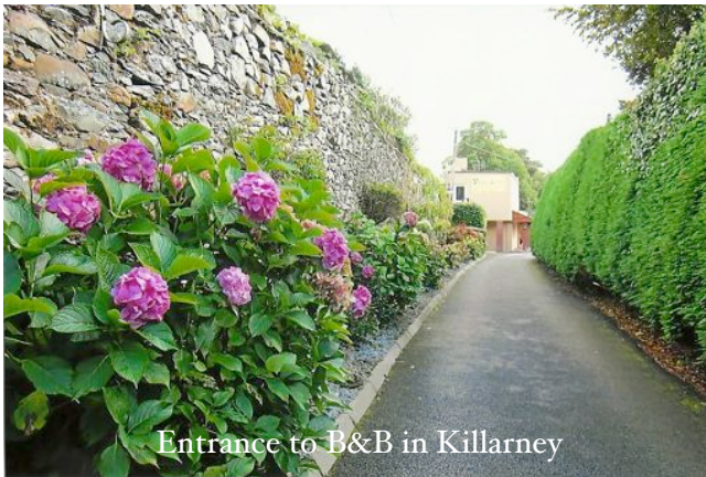
Entrance to B&B in Killarney

coral, greens, some blue and an occasional purple or touch of red. The hanging baskets and flower gardens are in abundance. Rhododendrons grow wild. The privet hedges are kept clipped and tidy. A few thatched roofs remain; peat is still harvested, dried and used for heating fuel. We saw countless sheep and cattle. Many