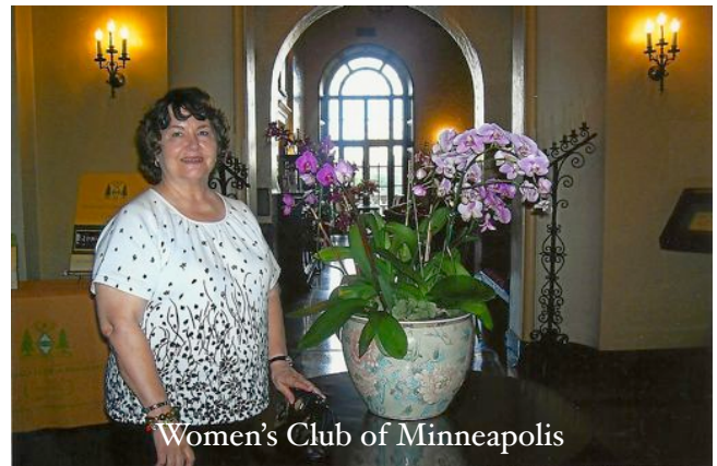
Women's Club of Minneapolis

purchased as Sears Catalog Homes, which made homeownership accessible to the primarily immigrant population of the city who could not afford the carpentry or craftsmanship to build single-family homes of the era. Most of these early homeowners were first and second generation Scandinavians.