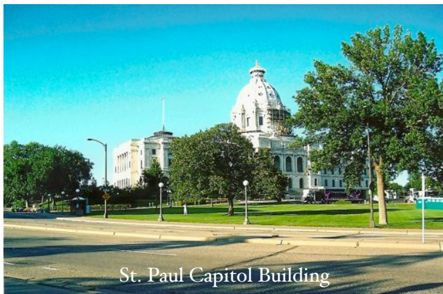
St. Paul Capitol Building

Following the SPAH convention, we spent four wonderful days in the twin cities of Minneapolis and St. Paul. The Schubert Music Museum is free and in the beautiful historic Landmark Building downtown St. Paul. The first room had a spectacular floor to ceiling art sculpture of real instruments. Next was a collection of grand pianos. One room had gongs and bells from Thailand and a video of a percussion orchestra performance. There were several other rooms of instruments, but we loved seeing the Classical Composers room where we could read original letters by Bach, Tchaikovsky, Handel, Beethoven, Chopin and several others. It was a great look into history of music.