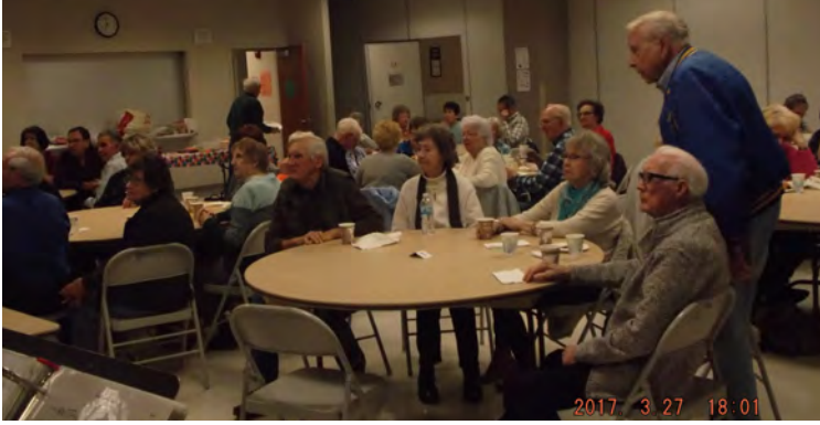
Gig at the Assumption 50+ Club, Assumption Parish, March 2017.