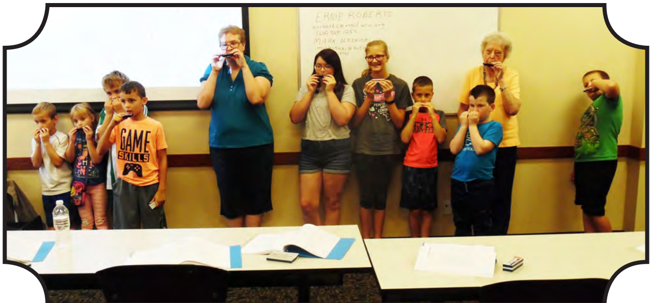
Children's Class at St. Charles County Library, Spencer Road Branch - July 23, 2018